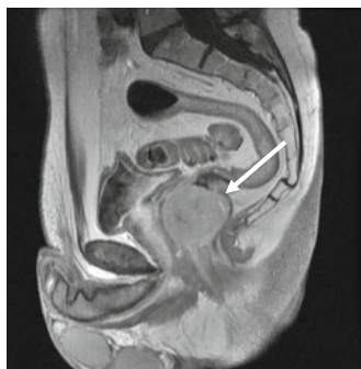
FIG. 2 Contrast-enhanced magnetic resonance image of primary low rectal gastrointestinal stromal tumor before ( right ) and after ( left ) preoperative imatinib for 8 months. Because the tumor harbored an exon 9 mutation, the patient was treated with a higher dose. Surgery consisted of local excision rather than a formal low anterior resection