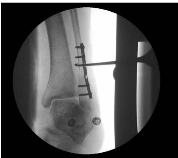
Fig. 1 The intraoperative hook test was performed observed under fluoroscopic control.

Boden et al. [2] performed a cadaveric study investigating the biomechanical considerations for the need for syndesmotic fixation. They studied 35 cadaveric ankles with pronation-external rotation (Weber C) ankle fractures. They assumed the interosseous membrane is disrupted to the level of the fibular fracture. They concluded either an intact deltoid ligament or an intact interosseous membrane provided enough stability to the syndesmosis once rigid medial malleolar and fibular fixation was achieved to prevent distal tibiofibular diastasis. They further concluded syndesmotic fixation in ankle fractures was not necessary if rigid bimalleolar fracture fixation was achieved, and finally no syndesmotic stabilization was needed in case of fibular fracture fixation without a medial malleolar fracture (only