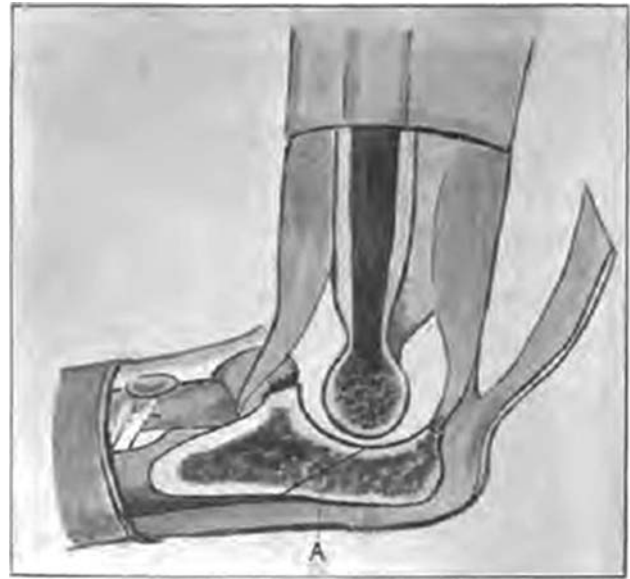
Fig. 34 Sagittal section through elbow joint. Olecranon is detached from ulna through oblique line. (A) Fascial flap shown with pedicle below.

Quénu (Société de Chirurgie, Paris, June 25, 1902) reported a case of ankylosis of the elbow joint treated by interposition of soft tissues after an extensive resection of the bony extremities. (Fig. 34. Editor’s Note: this figure is not from Quénu but rather one of Murphy’s cases from